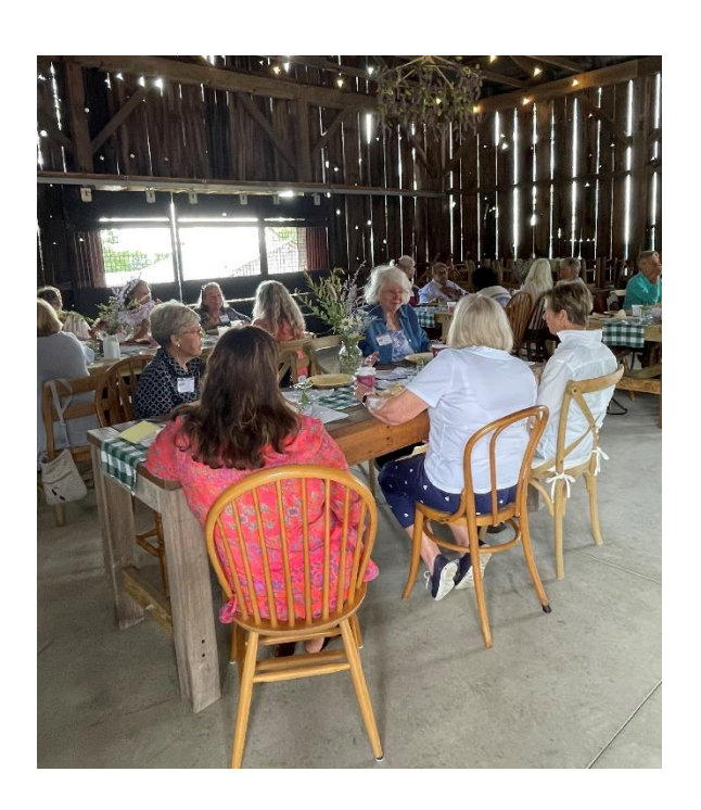
Enjoying a delicious lunch catered by Cables Deli