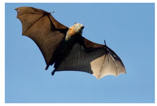
~The Daily Atom, September 18,2022

Over 300 species of fruit depend on bats for pollination. Bats also help spread seeds for nuts, figs, and cacao.