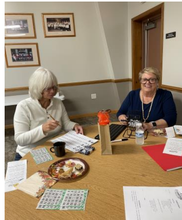
Our Bingo callers!