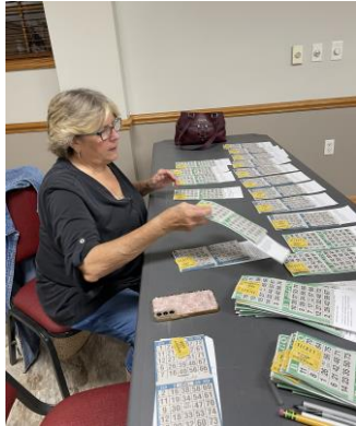
Bingo packets, ready to go!