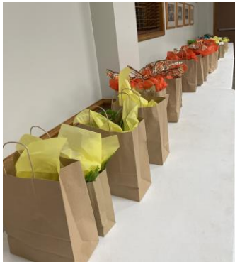
So many prizes!