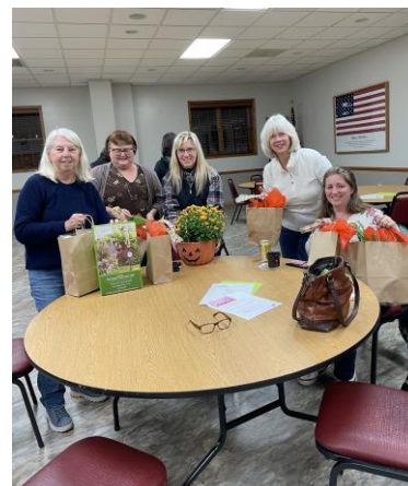
The big winners of the evening!