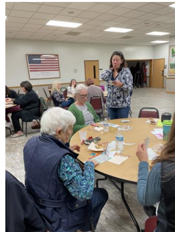
Enjoying the game!