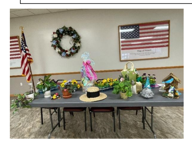
April's Bingo Meeting was a lot of fun and many members won a variety of garden themed prizes!